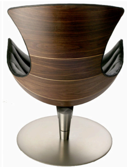
ORGANIC SHAPE - lund and paarmann