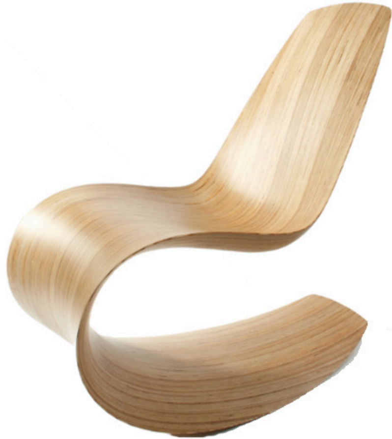
ORGANIC SHAPE - jolyon yates