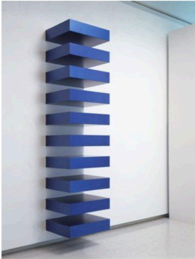
anodized aluminum each of 10 boxes 6 x 27 x 24 inches