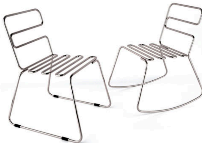
LINES - joel escalona