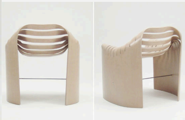
LINES - naruse inokuma architects