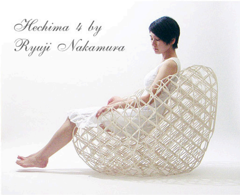
POSITIVE AND NEGATIVE SPACE