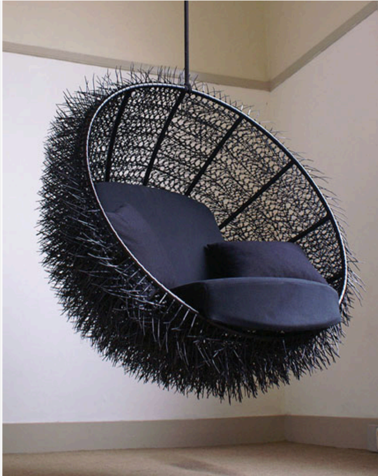
TEXTURE - rachel van outvorst