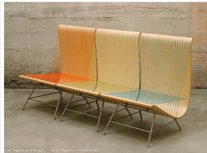
LINES - egawa and zbryk