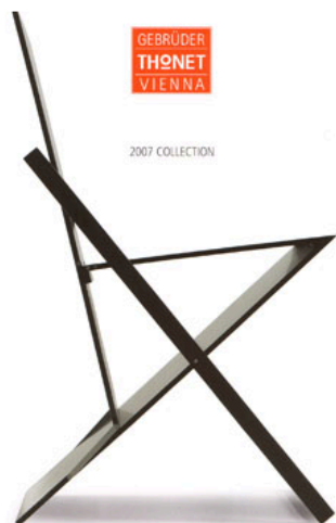
GEOMETRIC SHAPE - jake philipps