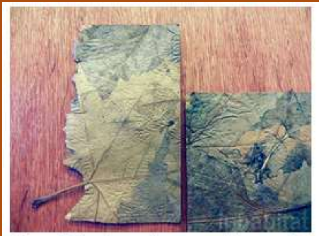
Meital Tzabari designed beautiful panels made from pressed fallen leaves.