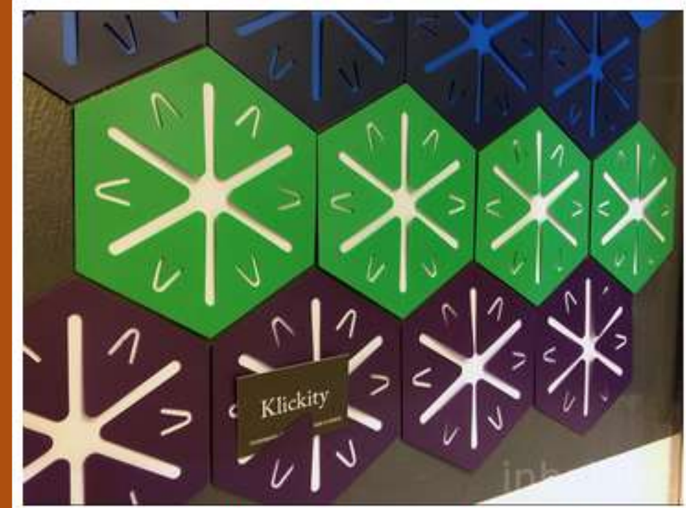
The hexagon shape of the sticky-backed Klip from Klickety allows you to create a modular bulletin board.

Klickity's accessories are designed and assembled in Ireland. The fig lamp, inspired by the traditional lantern shape, is made from 15 pieces of polypropylene, which come flat-packed. The lamp can be used with any standard pendant light fitting.