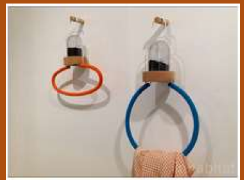
Bye Bye Laundry is a concept by