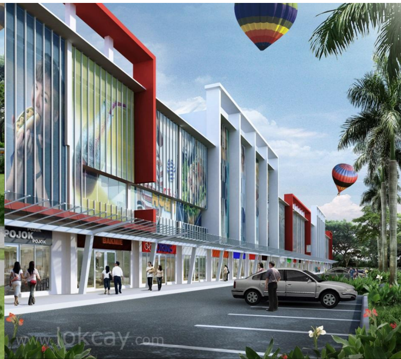
RUKO KEBAYORAN ARCADE 3 BINTARO JAYA