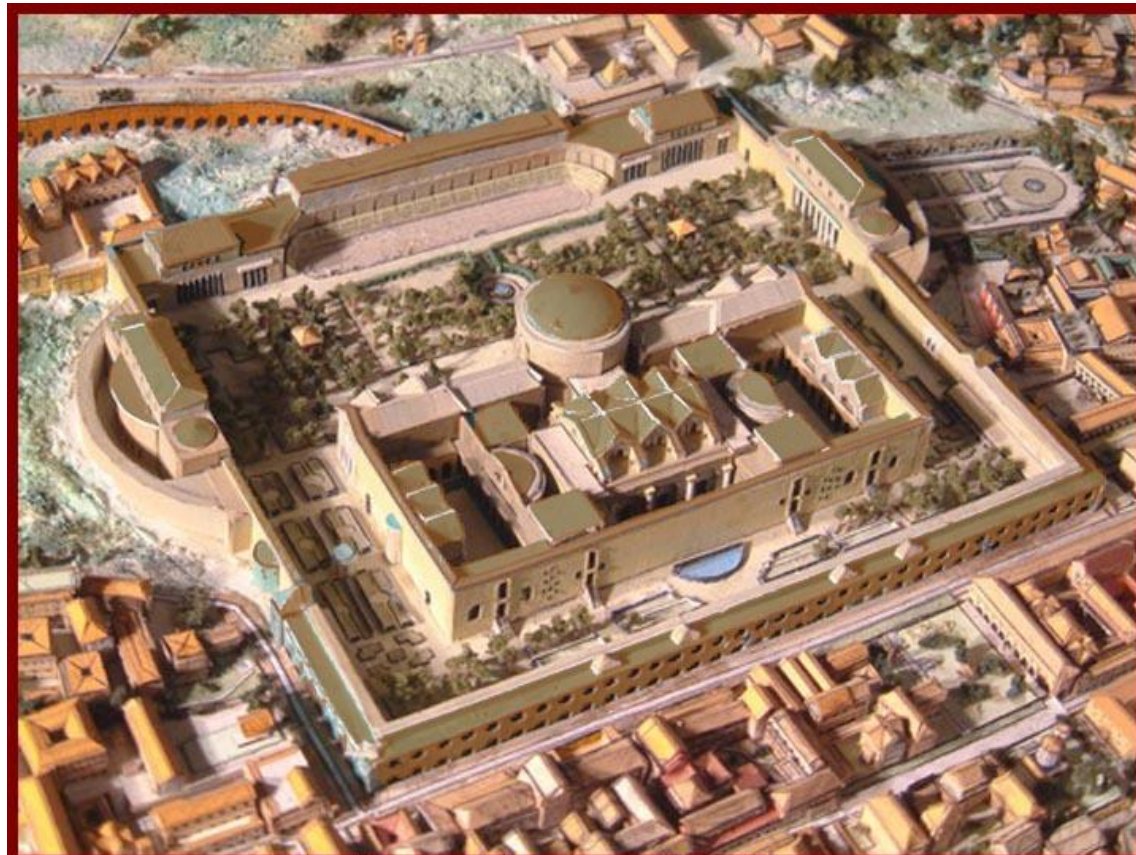
Baths of Caracalla, Rome