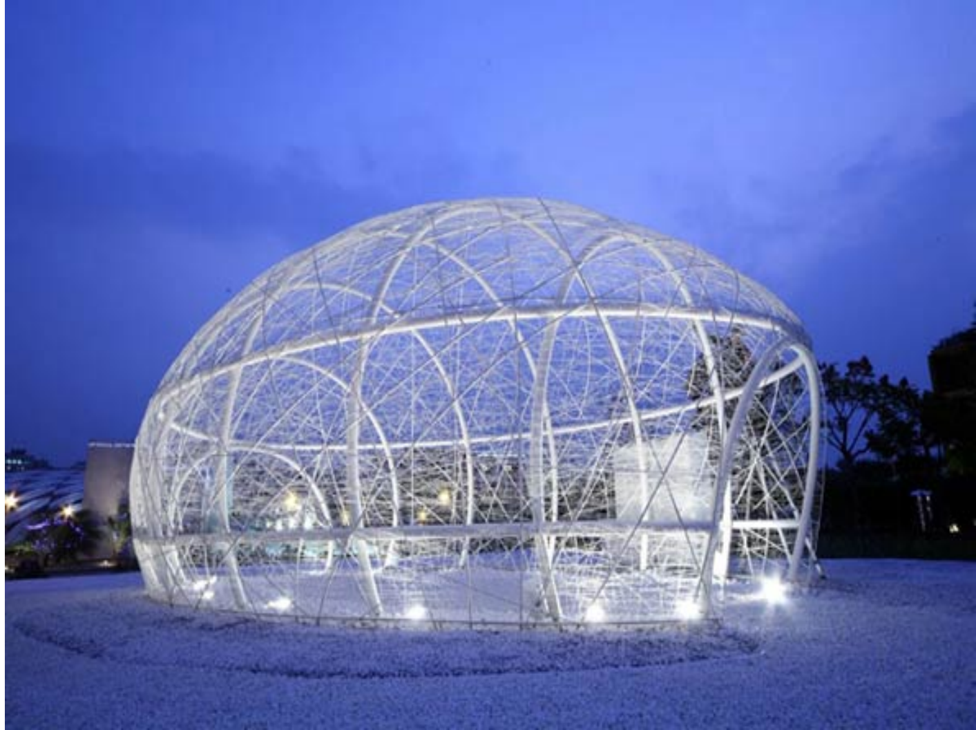
Spun Silent Garden