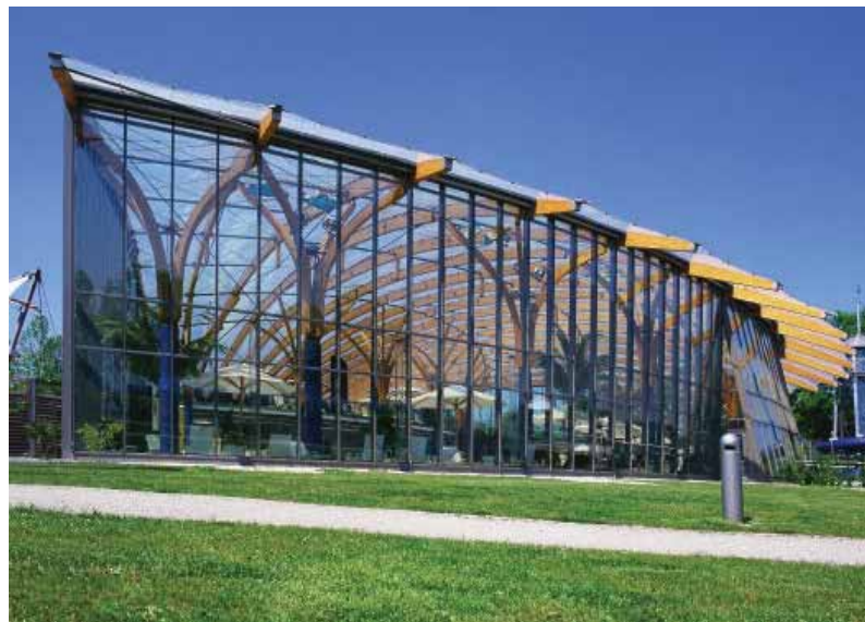
Prien Swimming Pool